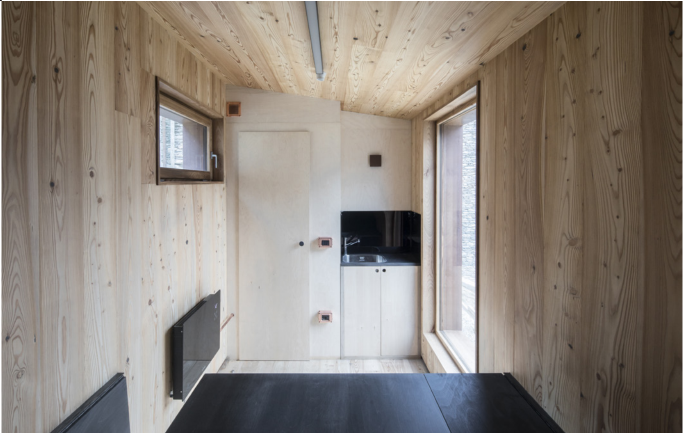
Fig. 4 Internal view.